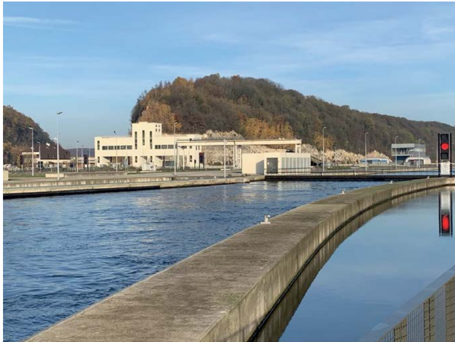
Figure 3. The lock at Ternaaien.

These advantages explain the rising amount of transport over inland waterways; this also induces a greater pressure on the associated infrastructure, notably locks. On many inland waterways, locks are required to ensure a suitable water level for navigation and to give ships the opportunity to overcome the difference in water level. In addition, locks can be used to bypass obstacles such as waterfalls or dams, and may serve as protection against floods; the latter type of lock is often found in harbors.