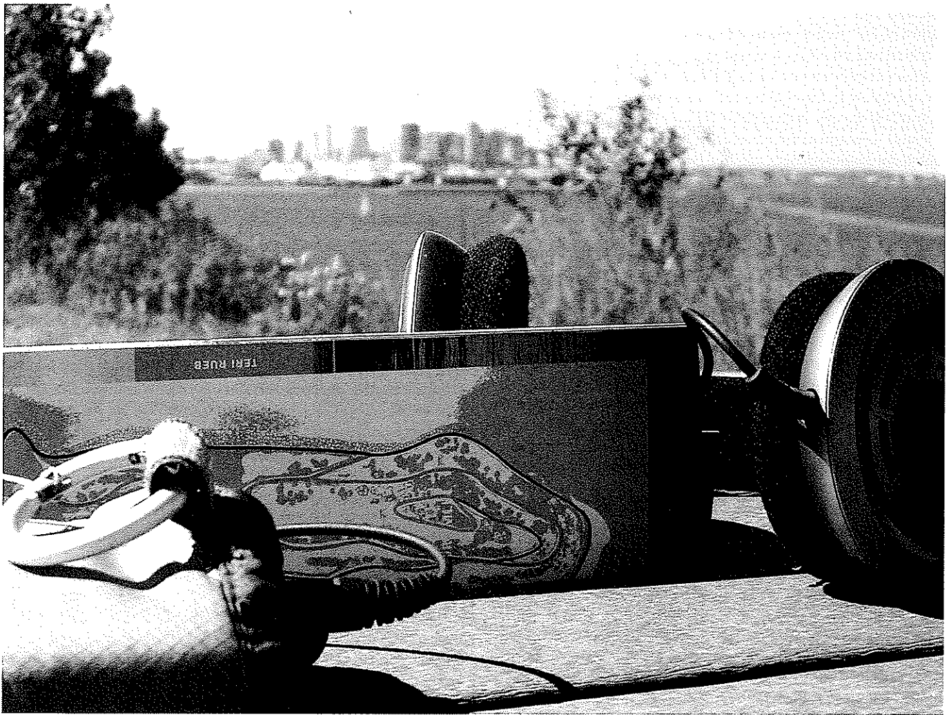
Figure 1: Impression from experiencing 'Core Sample' by Rueb (2007): headphones and PDA, exhibition booklet, view from 'Spectacle Island' toward the Boston Skyline.