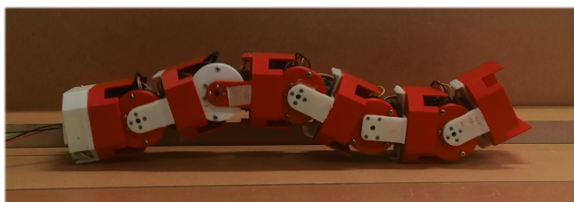
Figure 1: Rectilinear locomotion of a modular snake robot.

Learning from natural phenomena is widely considered to be important in developing key innovations and has been an inspiration for engineers for decades. One of the fascinating fields in research is the field of biologically inspired robotics [1]. This study will revolve around the locomotion of a snake robot [2]. Due to its small cross-section, a snake robot is ideal for locomotion in confined spaces. Snake robots can be used to inspect a pipe, a collapsed building or areas that are difficult to access by any other means. A unique characteristic of a snake is that it is very flexible. It can turn with little space and can propel itself forward using the environment whereas other robots generally avoid contact with obstacles. The goal of this study is to develop a generalized model for the 2-D locomotion of the modular robot snake depicted in Figure 1, developed at the University of Canterbury [3]. The aim is to have a single framework that can be used to model lateral undulation as well as a rectilinear locomotion.