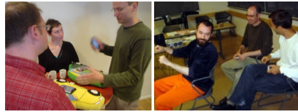
Figure 2: Mobile music workshops: a) Project demonstration and b) scenario bodystorming

In the 2 nd workshop, hands-on activities were kept to one afternoon. They focused on bodystorming of mobile music applications and scenarios. Bodystorming is a method where participants act out a particular scenario of use, taking the roles of e.g. users or artefacts and focusing on the interaction between them [6]. With this method, participants explored various mobile music themes, developed simple application ideas, and physically enacted scenarios of use in order to get an embodied understanding of design challenges and opportunities specific to mobile music.