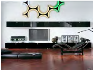
Fig. 4. Shared values transformed into artistic lighting