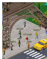
(b) i-Citizen 3D