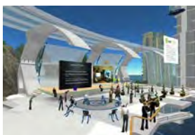
(a) Second Life

Virtual worlds such as Second life [1] (Fig. 1a), World of Warcraft [2], Habbo Hotel[3], Club Penguin and Webkinz have entered our lives, our communication patterns, our culture, and our entertainment. "It's not only the teenager active in. The average age of a gamer is 35 years by now, and it increases every year. This does not even include role-play in the professional context, also known as serious gaming, inevitable when learning practical skills. Virtual worlds are in use for entertainment, education, training, getting information, social interaction, work, virtual tourism, reliving the past and forms of art. They augment and interact with our real world and form an important part of people's lives. Many virtual worlds already exist as games, training systems, social networks and virtual cities and world models" [4]. Most of these virtual worlds are accessed on a personal computer - either through a dedicated application like Second Life, or through a Web browser. A number of companies are also looking at mobile devices as the next platform for virtual worlds, thanks to the ubiquity of mobile phones, and the way handsets are getting faster and more powerful, and so able to cope with this kind of content. For example, i-Citizen 3D (Fig. 1b) is one of these mobile virtual worlds, letting people wander around a series of locations based on real-world cities, such as London, Barcelona and New York.