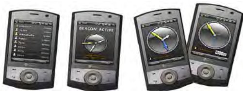
Fig. 5. Buddy compass for backpackers

Buddy compass is a mobile application designed for backpackers [35]. Backpackers not only form virtual communities on the Internet before and after travelling to share their experience and information, but also like to get together to meet each other in hotels, restaurants and hot spots. The problem is to find each other. The virtual compass, using a GPS sensor, indicates the direction and the distance of other backpackers who have been virtual friends in virtual community, who are now close-by in the real world and who are willing to disclose his or her physical location to other backpackers in the virtual community. The value of friendship is transferring from the virtual community towards the real world through a virtual object – the buddy compass.