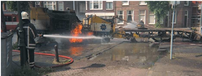
Fig. 1 Gas explosion in Leiden in 2001.

Throughout the Netherlands 22,500 km of unplasticised poly(vinyl chloride) (uPVC) pipes are in use for gas distribution purposes. Physical ageing causes embrittlement of these pipes [1] and can limit their residual lifetime. Replacement is costly, but can only be postponed if the risk on accidents, such as shown in Figure 1, remains very low. The goal of the present study is to investigate whether micro-indentation measurements can be used to measure the condition of uPVC gas pipes.