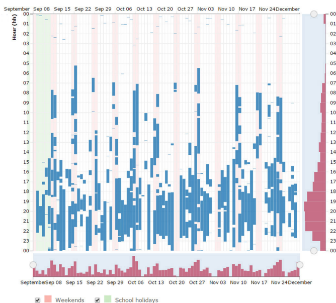
Figure 2. Visualization of TV usage during September–November 2013. The lower graph shows the total usage per day and the vertical graph shows the usage distribution per hour.