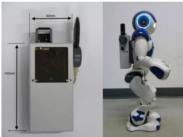
Figure 1. Prototype of LED projector unit (left) mounted on the humanoid NAO robot (right)

The prototype system is expected to bring added value by the mobility aspects. It is able to approach the user wherever the user is in the flat. This is considered to be a logical evolution from current technology. The main application areas are: (a) social communication (friends, family members, informal carers) (b) video communication to e.g. medical services and (c) video communication in case of emergency. For designing the concept as well as for concept validation experts from the care domain and older persons were presented with early prototypes and took part in “Wizard of Oz” tests in order to explore the potential of the solution from point of view of primary and secondary users of the system [11]. The levels of user acceptance, user interest and user engagement were high regarding the mobility of the video communication.