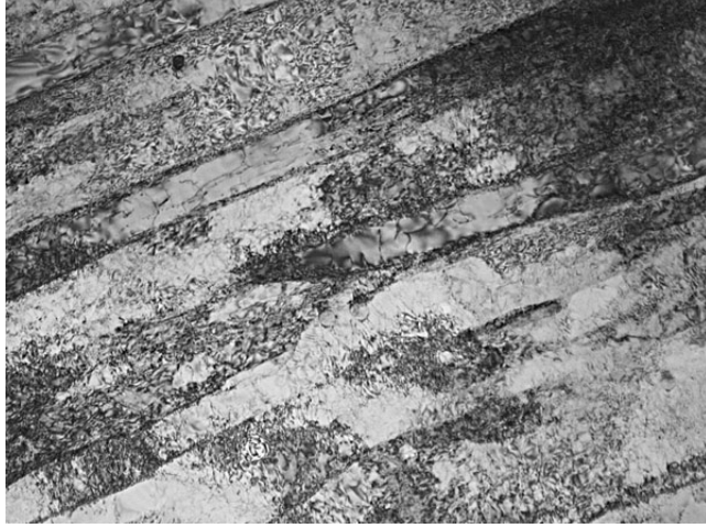
FIGURE 1. Typical dislocation band structures. Courtesy of © Fraunhofer IWS Dresden, Germany [IWS14].