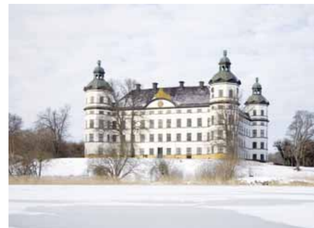
Skokloster Castle from the frozen lake Mälaren (Figure 2a)