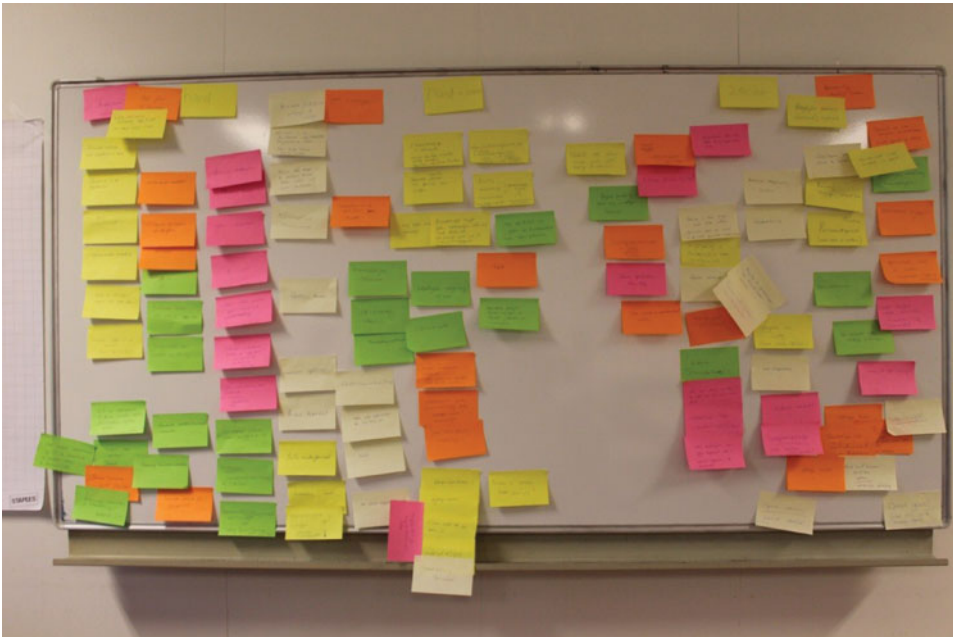
FIGURE 2 Process of clustering the sticky notes.

to English. To find out how often certain themes and subjects emerged in the notes, word clouds were made (Godwin-Jones, 2006; Rivadeneira, Gruen, Muller, & Millen 2007; Seifert, Kump, Kienreich, Granitzer, & Granitzer, 2008; Viégas & Wattenberg, 2008) using the five colors of the notes. This showed the main points of focus in the groups. A word cloud is a visual representation for textual data, typically used to depict keyword metadata (tags) on Web sites or to visualize free-form text. Tags are usually single words, and the importance of each tag is shown with font size or color. This format is useful for quickly perceiving the most prominent terms and for locating a term alphabetically to determine its relative importance.