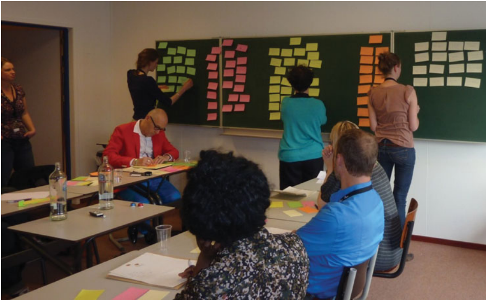
FIGURE 1 View of one of the sticky notes sessions.

and share it with the group (Ismail, 2013), so the participants needed to be concise in their responses. There was no limit on the number of ideas that the participants could write down. However, the ideas had to be related to the theme of the session: the future nursing home.