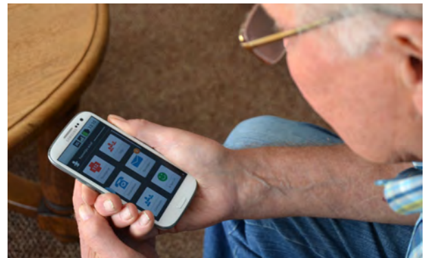
Figure 1: The GoLivePhone©, referred to as mobile interface.

come forward as important. Finally, way finding is seen as contributing to the quality of life of people with dementia in general (Rasquin, Willems, de Vlieger, Geers, & Soede, 2007).