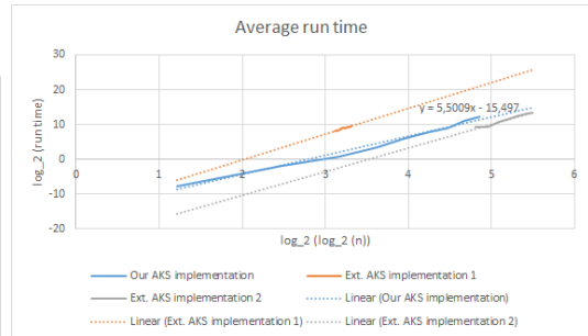
(a) Comparing our implementation with 2 other versions found online. The solid lines consist of the gathered data. The dashed lines are trend lines made using the data points.