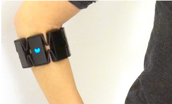
Figure 1. The Myo sensor bracelet used to measure gestures.

We built a gesture database using a Myo sensor bracelet (ThalmicLabs, 2016), which is worn just below the elbow (see Fig. 1). The Myo’s inertial measurement unit measures the orientation of the bracelet. This orientation signal is sampled at 6.7 Hz, converted into the direction of the arm, and quantized using 6 quantization directions. The database contains 17 different gesture classes, each performed 20 times by the same user. The duration of the measurements was fixed to 3 seconds.