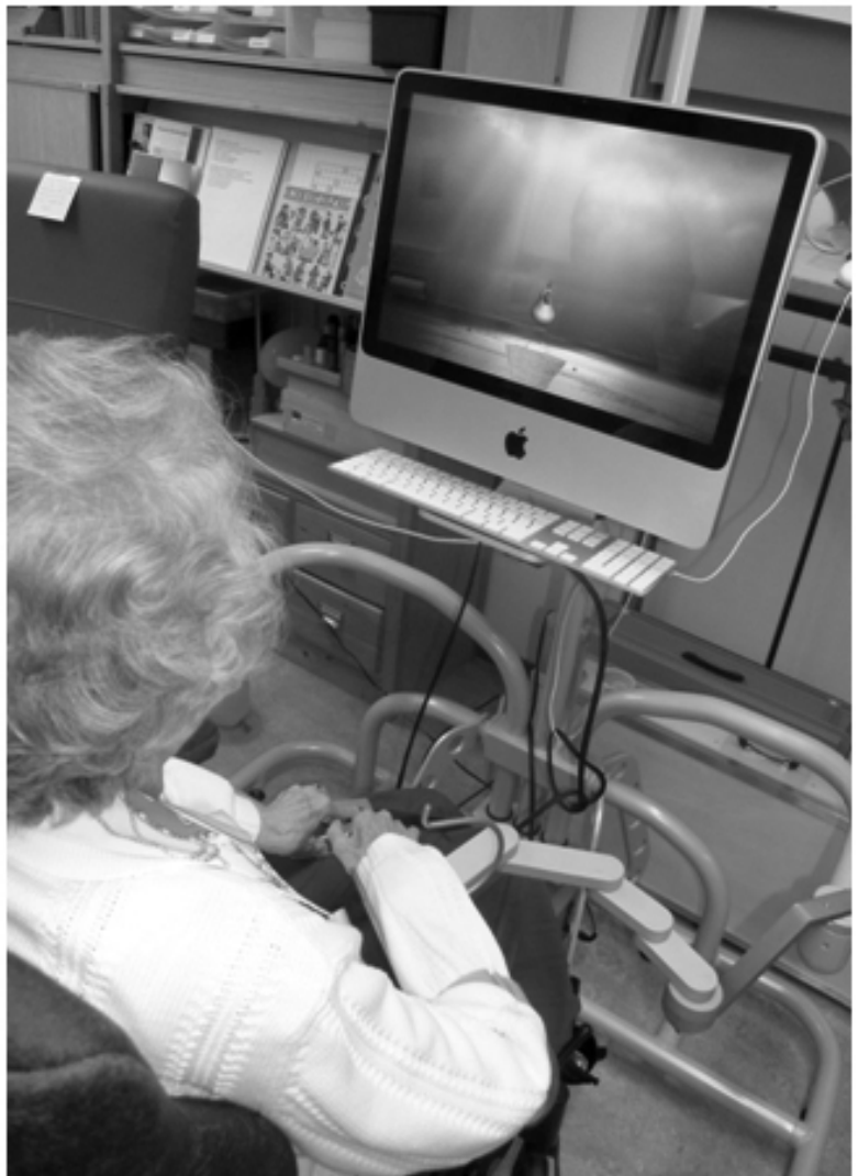
Figure 1. Playing a game using the supported human arm as a joystick