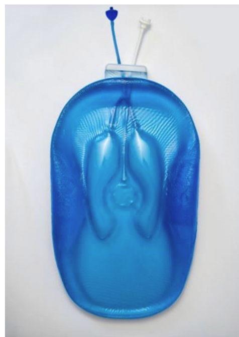
Fig. 1. The BabyBe mattress.

a Defined as the number of days between the first and the last days of the intervention.