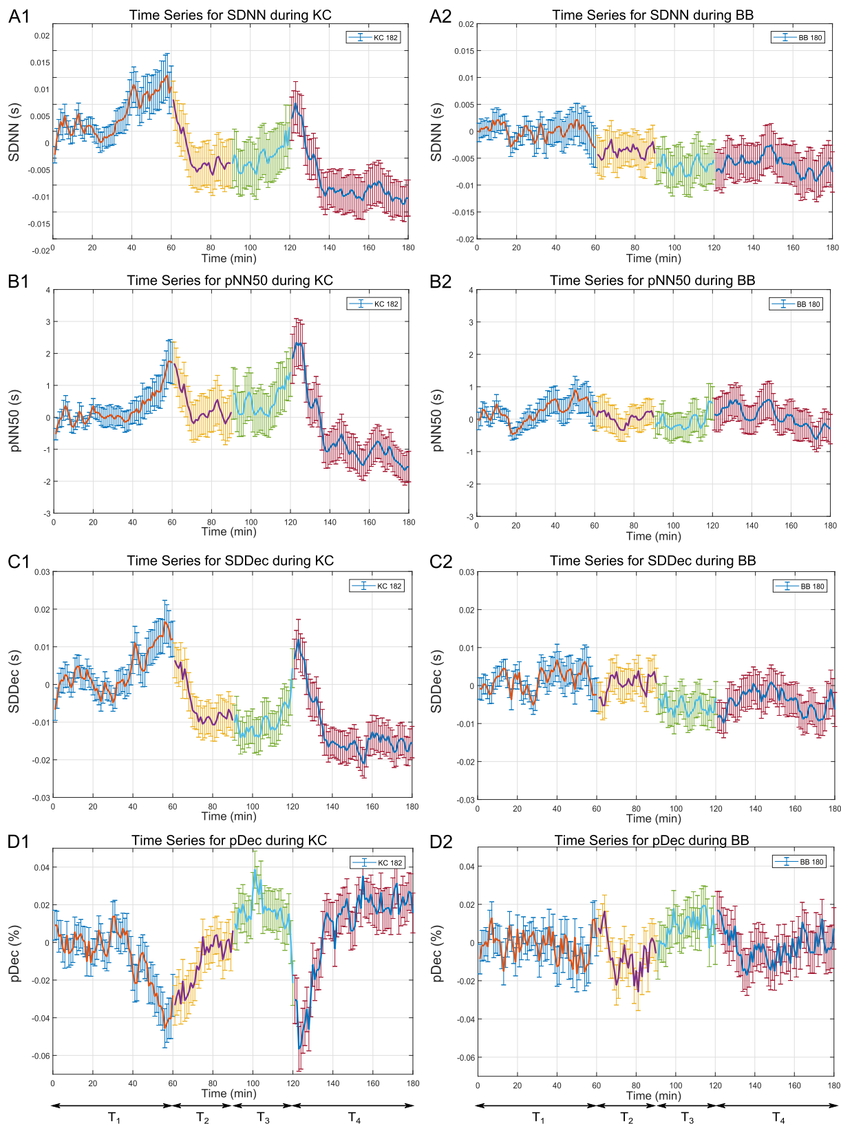
Fig. 3. Time series of four HRV features during KC sessions (left) and BabyBe sessions (right). Normalized mean \pm SEM values are shown for the pre-intervention periods (0–59 min), the first 30 min of the intervention period (60–89 min), the last 30 min of the intervention period (90–119 min), and the post-intervention period (120–180 min). The y-axes represent normalized values of the SDNN (A1 + A2), pNN50 (B1 + B2), SDDec (C1 + C2) and pDec (D1 + D2). Note that the RMSSD is not shown due to its overlap with the pNN50 and SDDec precedes pDec to enhance the comparability of the time series.